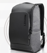
Lenovo Legion 15.6" Recon Gaming Backpack

* Example of Lenovo catalogue naming convention