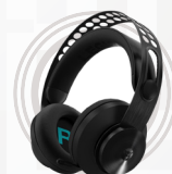
Lenovo Legion H300 Stereo Gaming Headset