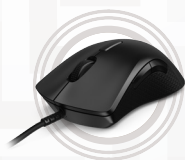
Lenovo Legion M300 RGB Gaming Mouse